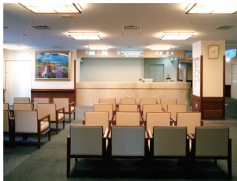
1st Floor Reception

Tel. 03-3951-111 1 OBS-Gyn: (Only for 2nd Consultation patients) Pediatrics : (1 month check, Development, Neurology, Enuresis, Allergy, Cardiovascular) ENT: (Voice, Hearing Aide, Schoolchildren) Dermatology: (Schoolchildren, Phototherapy, Laser, Pimple Treatment) Ophthalmology: (Strabismus, Amblyopia, Nystagmus , Botulismus ) Breast Clinic Various Medical Check ups