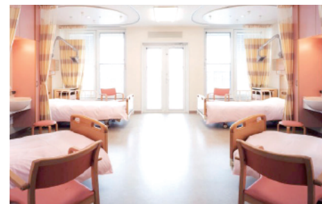
4 Bed Ward

9:00 AM 4:30 PM except 3 rd Saturday, Sunday & Holidays