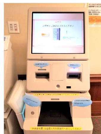
Automated check-in machine