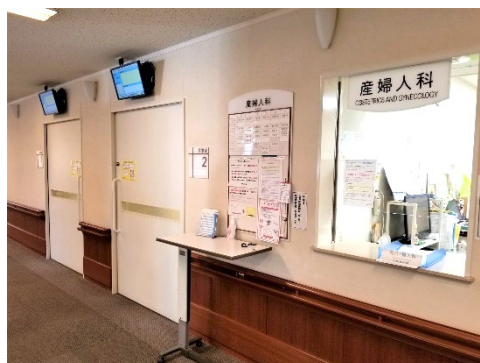
Outpatient OBS/GYN counter